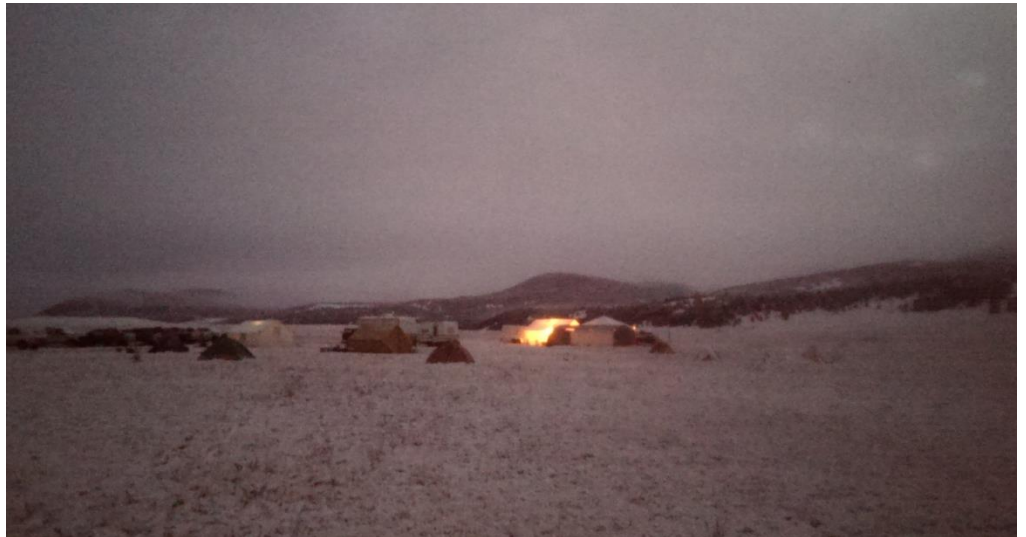
The remote camp set up included catered meals, propane heaters and lots of laughs and catching up as biologists from across the west gathered together for a common goal. The snow and cold couldn't keep us away.

For this project to be successful, a host of NMDGF staff were involved in its planning and implementation. Not only were the treatment details important (e.g., building and testing equipment, chemical distribution logistics), but the tasks associated with running a remote camp for that many people were just as important. With night temperatures in the low 20's, a camp with some heated wall tents, catered meals, and other comforts helped keep our spirits up and the project moving forward. So far all the data suggest that the treatment was successful. But just as importantly, I was pleased to see so many biologists and other staff from diverse backgrounds working together and forging new relationships.