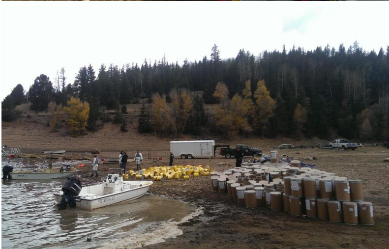
After the treatment, all rotenone barrels and cans from the 23 tons of chemical that was dispensed had to then be rinsed and compacted for disposal.