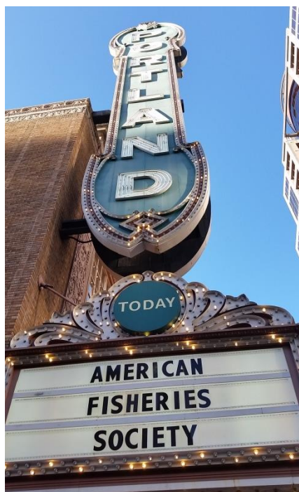
Fish heads take over downtown Portland

provided every meeting participant with a free public transportation pass for the duration of the meeting; a huge help seeing as how my hotel was located on the opposite side of the Willamette River from the meeting venue at the Portland Convention Center. My worries disappeared as I rode the train and saw an ever increasing presence of "fish heads" board the train at each stop. We were clearly identifiable throughout the city due to our conference lanyards and conference logo computer bags. Fish Heads had taken over downtown Portland. And then it hit me..."Look at all of these people working towards managing and protecting the same resources that I do!" It was time to get down to business.