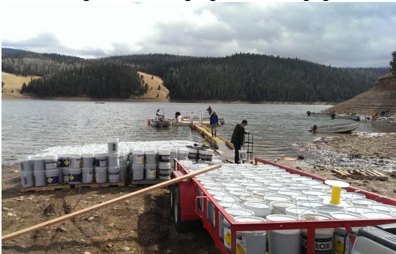
Preparation started years before the treatment, but the week and days before chemical had to be transported, stored, and made ready for the big day.