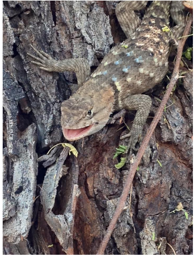
"Smile Lizard on mesquite tree"