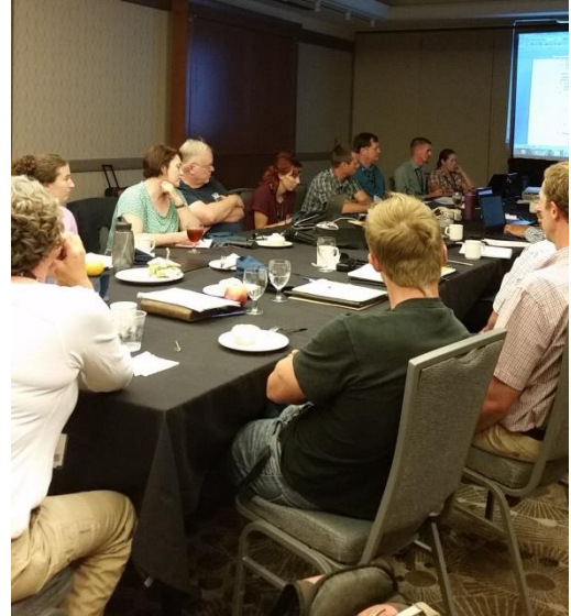
Western Division Excom Meeting

The theme of this year's meeting was...No Theme! AFS wanted everyone in the meeting to participate regardless of your specialty. There were 3,310 attendees, representing 32 countries, participating in 101 symposia, with over 2,000 oral presentations. Trying to plan your daily schedule can get a little hectic with all of those choices! I participated in the following symposia: What's New with Native Trout, Developments in Low-cost Side Scan Sonar Applications in Aquatic Research and Conservation, Watershed Scale Piscicide-Driven Restoration Efforts: Challenges and Successes in Endemic Species