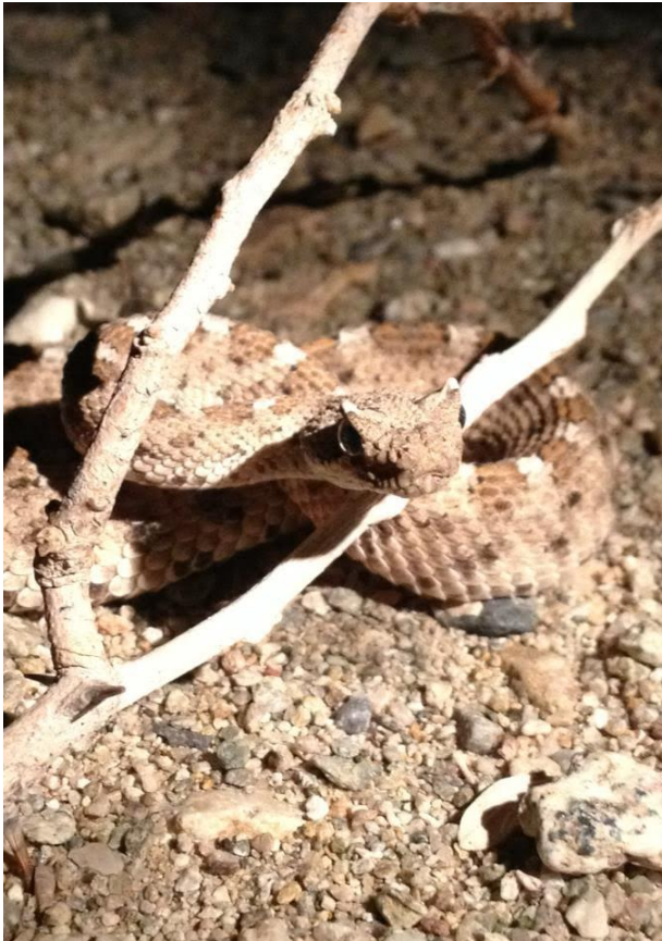
"Fred the Rattlesnake"