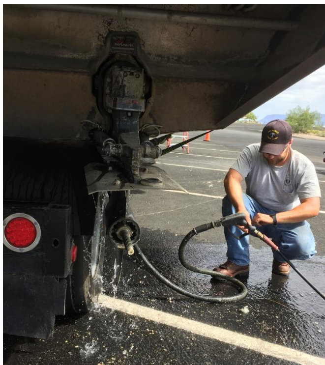
NMDGF employee using hot water to decontaminate the boat.

Working in 100+ degree temperatures over the course of two days, AZGFD employees and staff from Pacific States Marine Fisheries Commission scraped, vacuumed and used 140+ degree water to decontaminate the houseboat. Thousands of adult quagga mussels were removed during the decontamination, all which had the ability to reproduce and infest another waterbody.