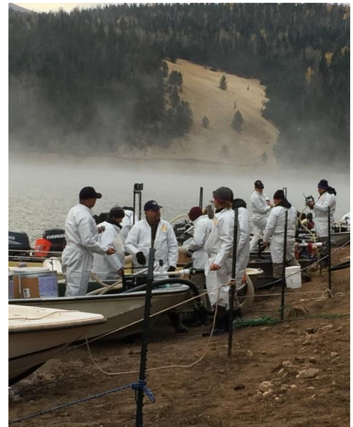
Biologists getting ready to treat the reservoir.

One week after the rotenone treatment, NMDGF staff returned to neutralize rotenone left in the reservoir. As suggested by in situ bioassays, we applied potassium at a rate of 2 parts per million (ppm), or about 23 tons on chemical, to neutralize the 1.5 ppm of rotenone we applied. The day after we applied the potassium permanganate, sentinel fish indicated that the rotenone had been successfully neutralized.