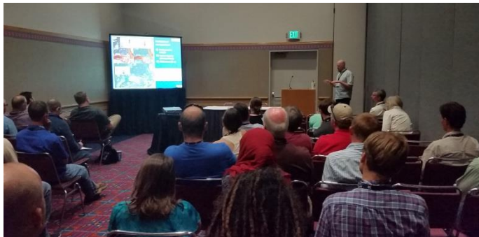
Side Scan Sonar Symposium well attended!

Recovery, and Communication and Engagement in Fisheries Management: Working with Stakeholders to Achieve Sustainable Fisheries and Healthy Ecosystems. I also had the chance to see at least a hundred more presentations scroll past my face as I volunteered for a three hour shift uploading presentations for the duration of the meeting.