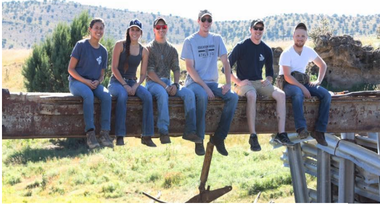
Members that assisted with stocking the Rio Penasco.

We have also participated in NMSU street fairs that are great opportunities to promote our student chapter of AFS. In addition to outreach, we have had an electrofishing clinic that was taught by the student chapter president where the basics of using a backpack electrofishing unit were specified. Mesilla Valley Flyfishers invites us every year to help stock a section of the Rio Penasco that they have