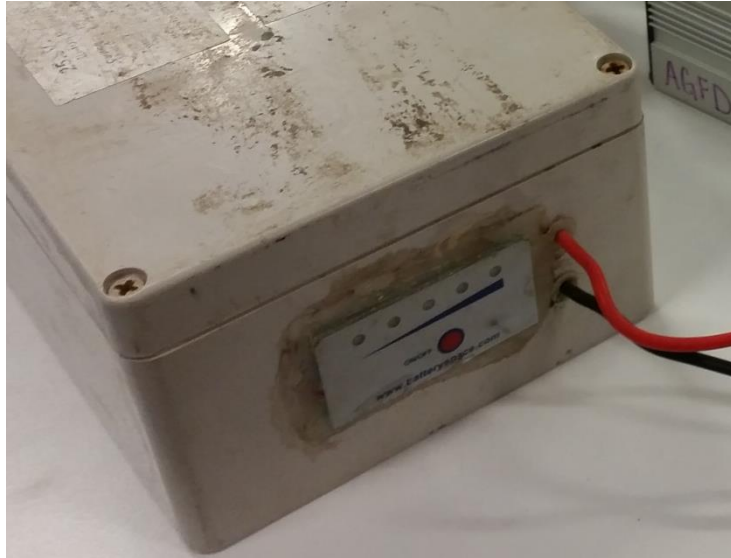
"Fuel gauge" that tells you the charge status by pressing red circular button.

In addition, maintenance on these batteries is easy since lithium-ion chemistry batteries typically have a low self-discharge rate and no special desulfation charging cycles are necessary. Battery chargers are available from the same company for less than $100 that will charge a fully discharged battery in under two hours. We have a pair of batteries and charger that are on their fourth field season of regular use with no indication that their capacity has decreased, although we only expected three to four years of life.