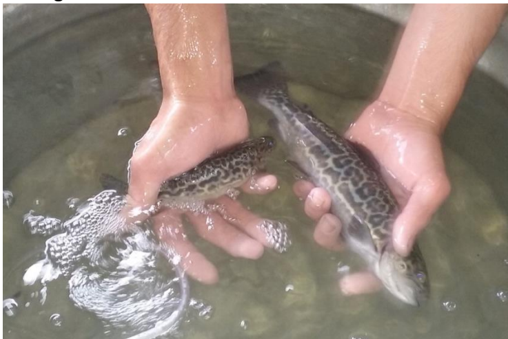
Varying sizes of tiger trout in the hatchery

As with anything new, raising and stocking these trout came with its challenges. Tiger trout are relatively new compared to the rainbow trout as far as culture of, or rearing, these fish. Our hatchery staff learned this the hard way. Apparently, tiger trout are rather particular with their food compared to rainbow trout. When hatchery staff feeds fish, it's usually a food frenzy as soon as the pellets hit the raceway. This is not so with tiger trout, as most of them didn't take the pellets. Interestingly, when our hatcheries switched to a higher grade of food, the tiger trout refused to eat it!