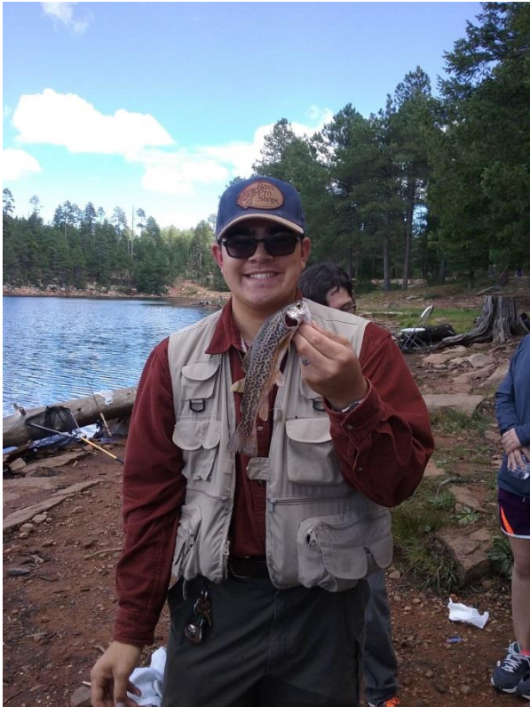
Happy angler with a tiger trout at Woods Canyon Lake.

On the management end of things, a few different surveys have been conducted to assess angler satisfaction, condition, survival/persistence, and catch rates. Intensive creel surveys at these lakes were conducted this past summer. Preliminary data shows higher catch rates in the fall versus the summer and more tiger trout being caught on lures/flyes versus bait. Many anglers found tiger trout more challenging but more fun to catch, as they said they are more aggressive than rainbow trout. Many anglers can't wait for next year, when the tiger trout are larger!