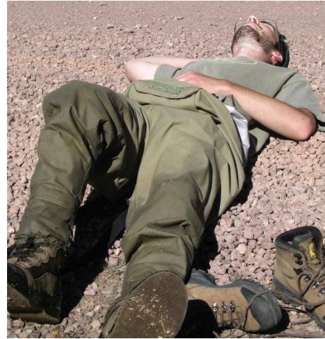
Intern after lugging heavy batteries around all day

Lugging heavy electrofisher batteries through the wilds of Arizona has always been a personal favorite of mine. A typical field day sampling a stream with backpack units would see us take three of the 12 amp-hour batteries with us for a day's work, meaning we had 44 ¼ pounds of lead and acid with us. Other common limitations of these low tech batteries was their limited lifespan (two to three years of field use), need for maintenance charging cycles, and the inability to quickly determine the charge status of a spare battery. Electrofisher manufacturers have certainly responded to these complaints by offering new lithium-ion battery technology, but at approximately three times the cost and only 80% of the battery capacity of our beloved lead-acids.