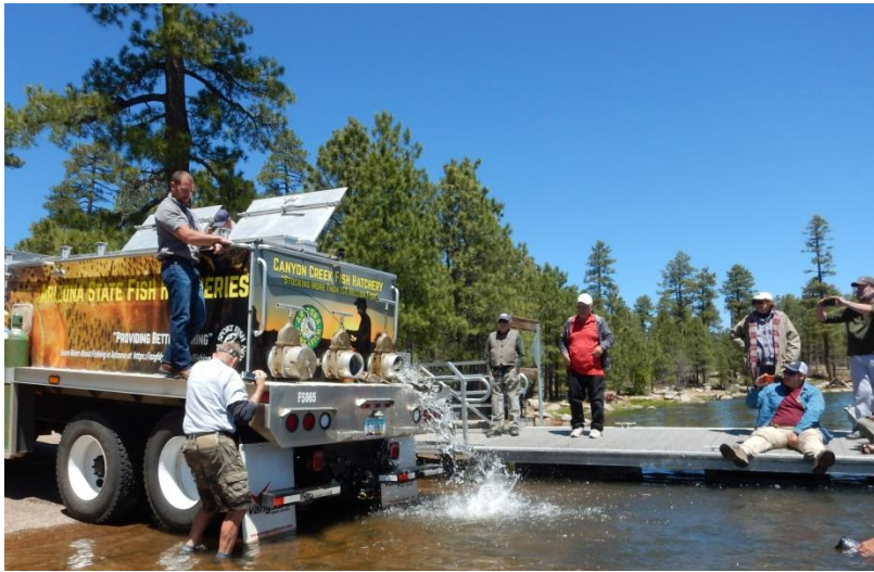
Crowd of people at first stocking of tiger trout into Willow Springs Lake!

Arizona Game and Fish Department used various forms of media to promote tiger trout fishing including local news, newspapers, press releases, posts on Department Facebook pages, signs at the lakes, and talking with the public and angling groups. Even with our media, some anglers still didn't know that there was a new trout at the water they were fishing! Many anglers were rather satisfied with the addition of Tiger Trout to the water they were fishing and had suggestions on where else to stock these fish!