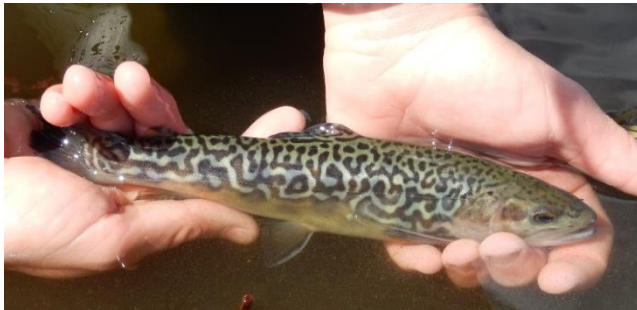
Tiger trout. Notice the very distinct pattern.

Reservoir Biologist, Region I Arizona Game and Fish Department